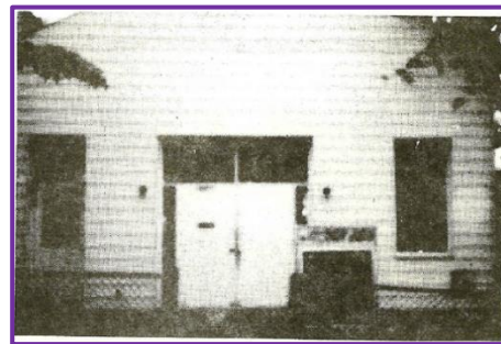
2417 Naylor Road, S.E., Washington, D.C.